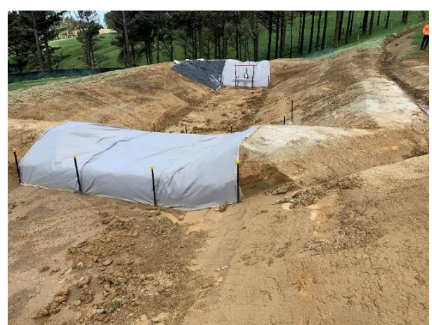
Figure 2. Sediment Retention Pond