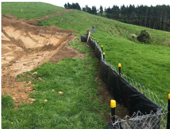
Figure 3. Super Silt Fence controlling sediment run-off while primary control is constructed