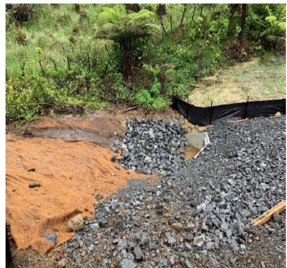
Figure 4. Culvert installation