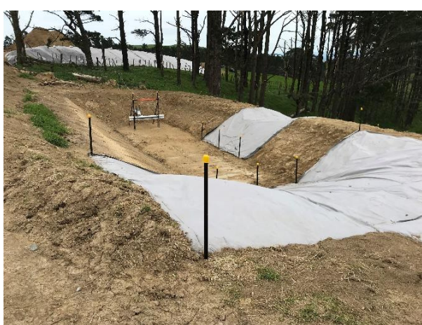
Figure 1. Decanting Earthbund

7.7. Figures 1-4 show some of the environmental controls installed on the Windfarm.